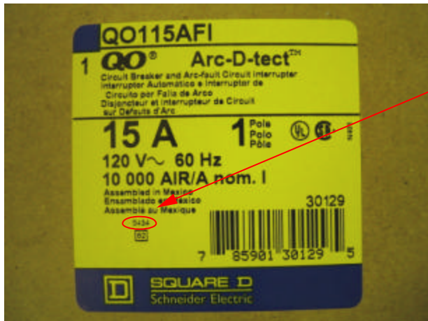
Carton Date Code